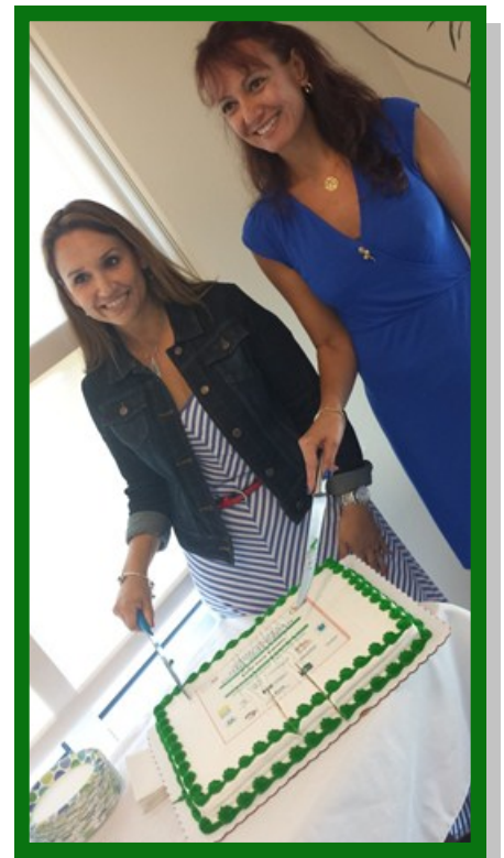
Children Issues Committee